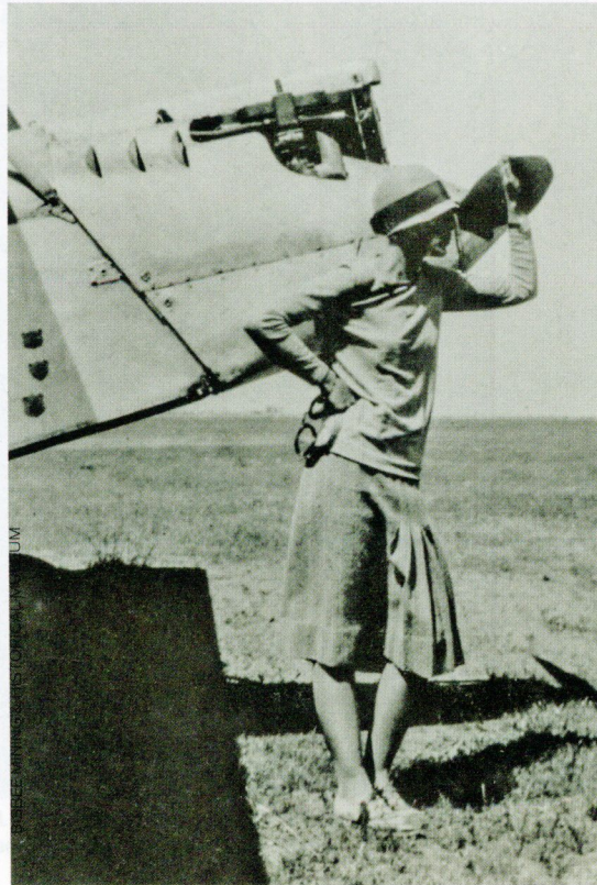
Famed aviator Amelia Earhart strikes a pose after landing in the small town of McNeal in 1928.

The plane sputtered as it banked, then touched down in a field studded with tumbleweeds and mesquites. In