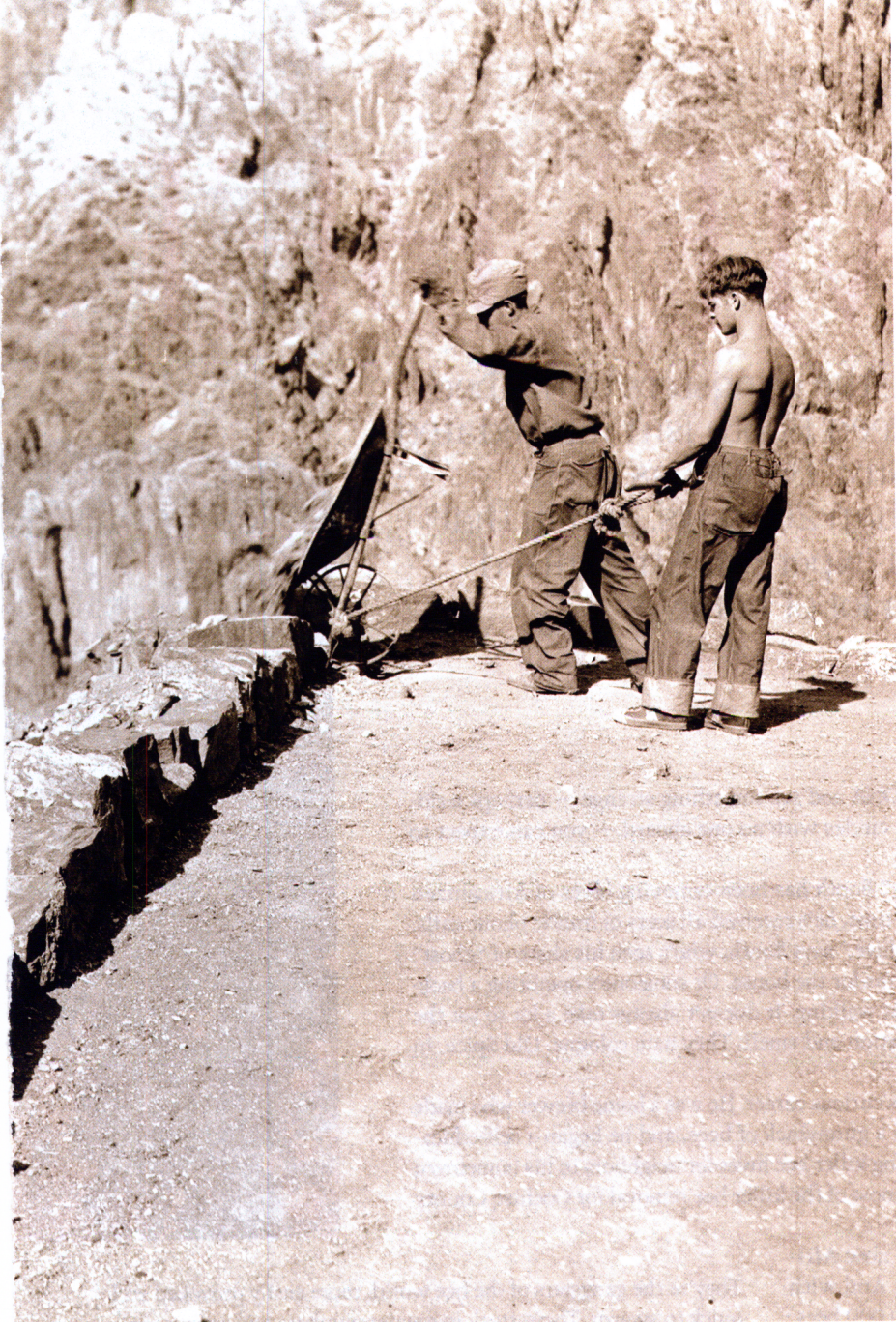
ABOVE: CCC enrollees construct a trail to the Colorado River within the Grand Canyon in 1934.